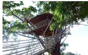
TREE HOUSE IN MAWNLNNONG