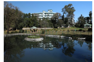
LADY HYDARI PARK