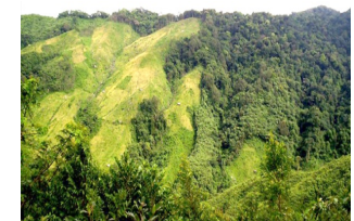
NOKREK NATIONAL PARK